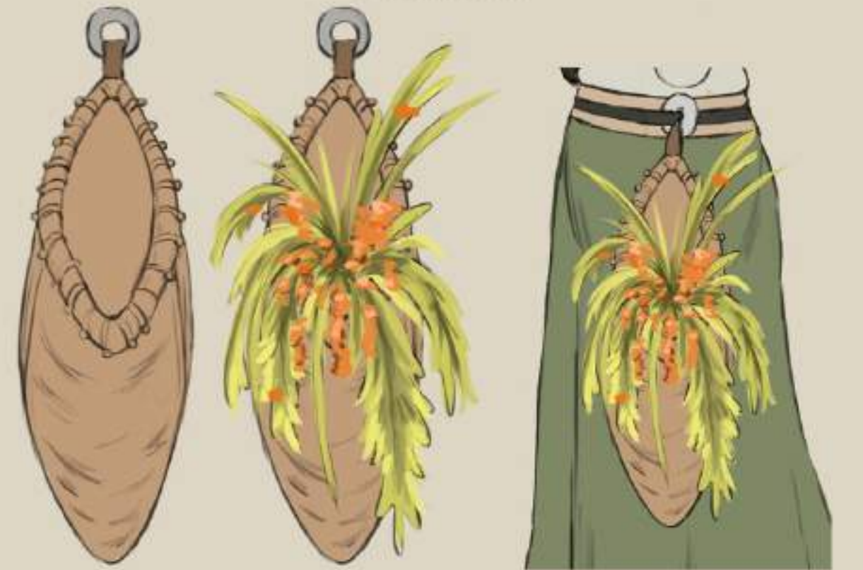
Side View of Carrier