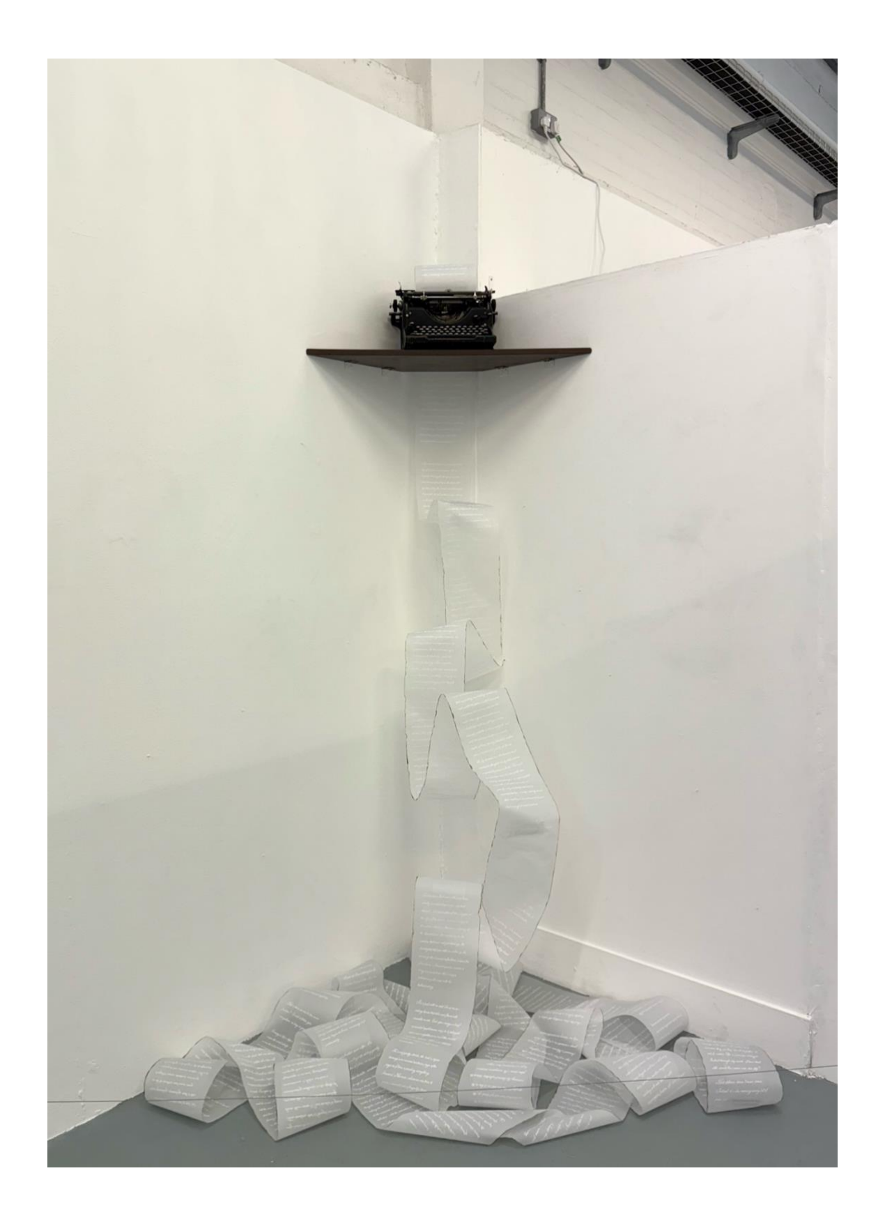
A Self-Directed Novel, 2025