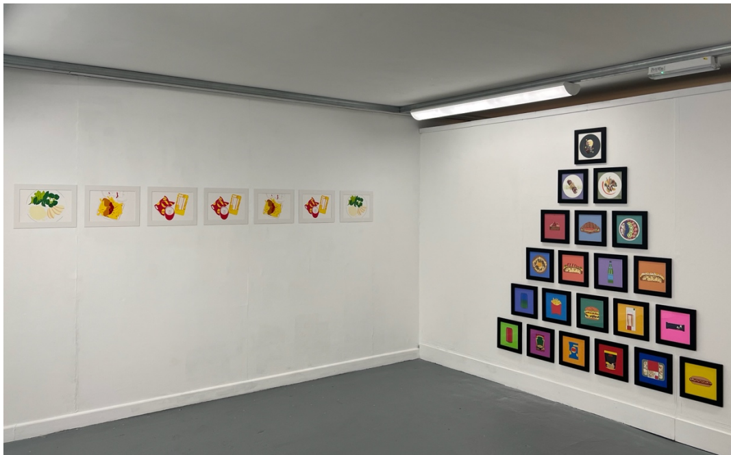
Full view of the artworks