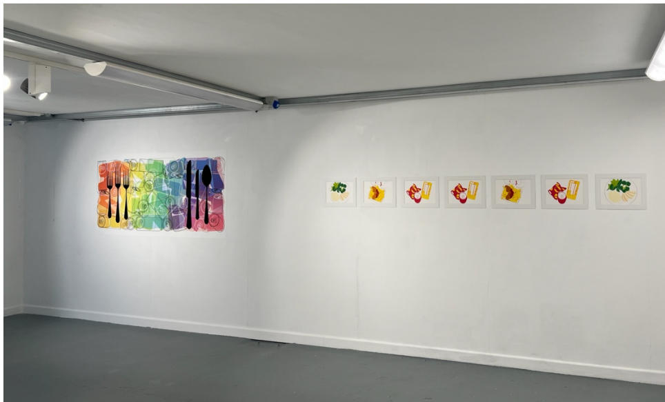
Full view of the artworks

Lunch explores the relationship between social class, time, and food choices across a typical week. It questions whether food choices are personal or shaped by systemic inequalities and time constraints.