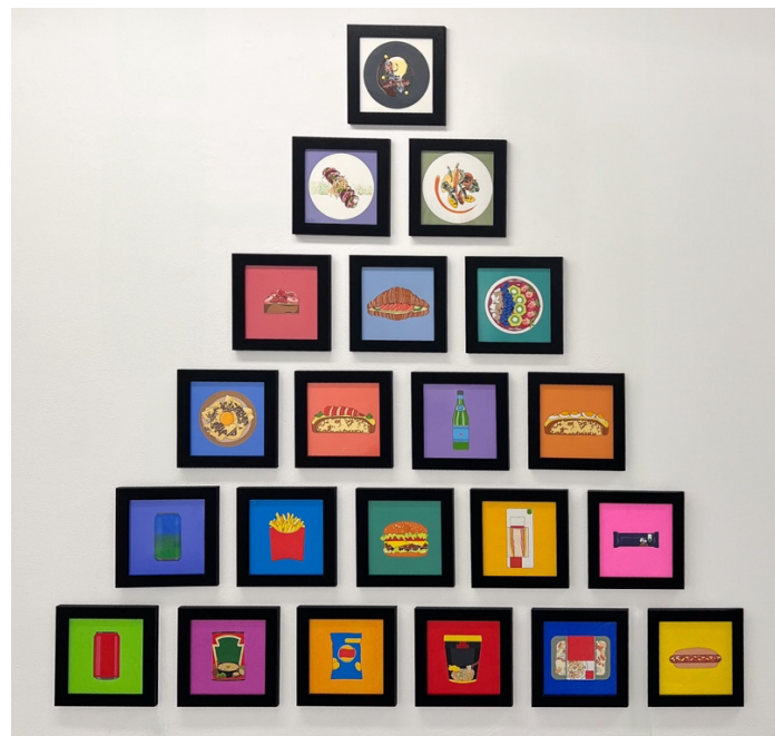
Habitual , 2025, Screenprint on paper, 21 panels, each 20 x 20 cm

Habitus explores the shaping of dietary habits across social classes. Through 21 depictions of food, it reveals complicated access to balanced nutrition from economic and social factors, exposing the tensions between aspiration, necessity, and inequality in food consumption.