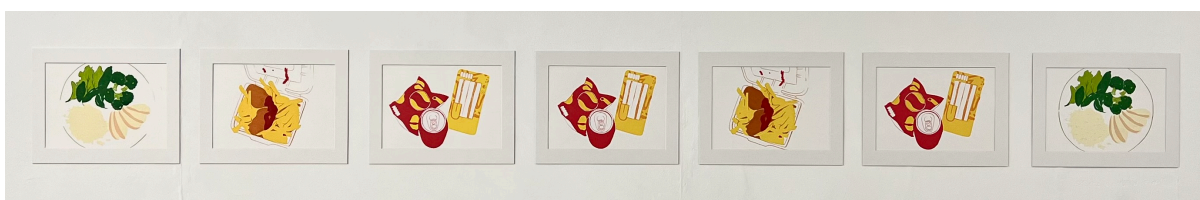
Lunch , 2025, Screenprint on paper, 7 panels, 35.56 x 27.94 cm

Habitus explores the shaping of dietary habits across social classes. Through 21 depictions of food, it reveals complicated access to balanced nutrition from economic and social factors, exposing the tensions between aspiration, necessity, and inequality in food consumption.