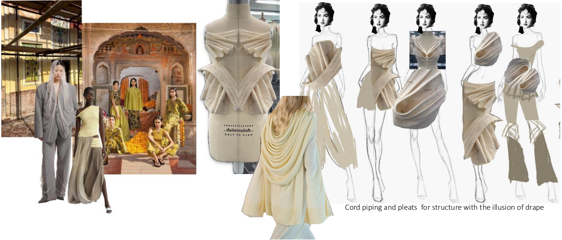
Cord piping and pleats for structure with the illusion of drape