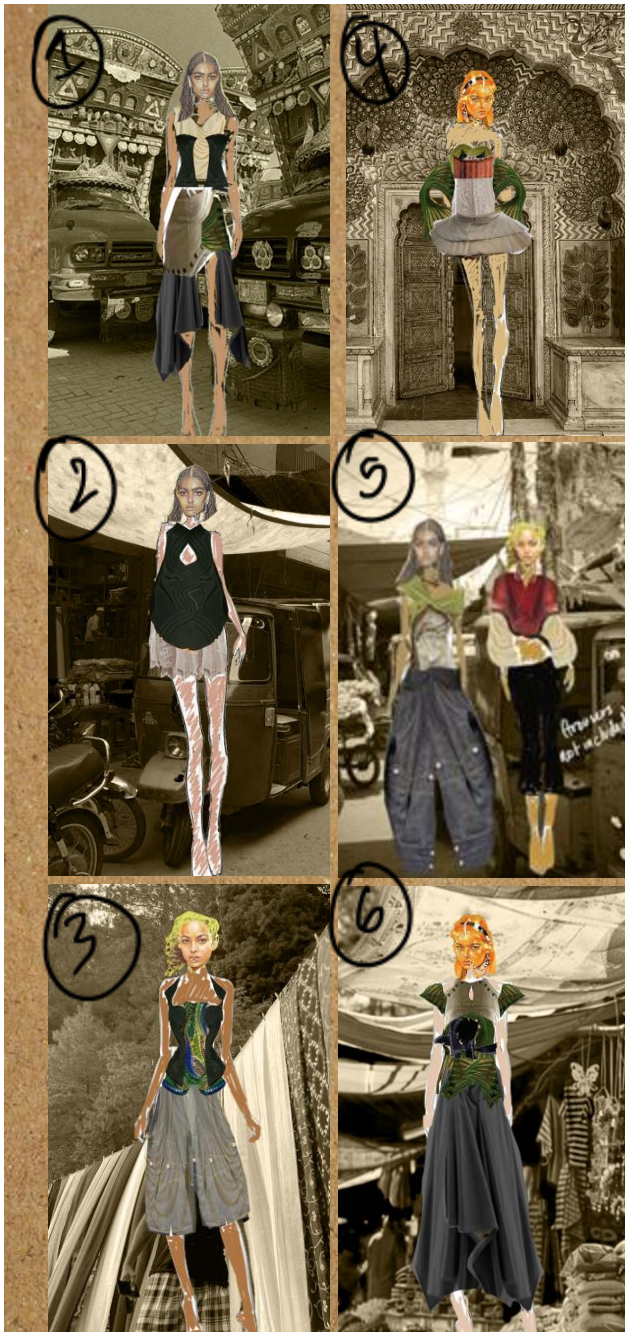
Final Line up – Collage and Illustrations